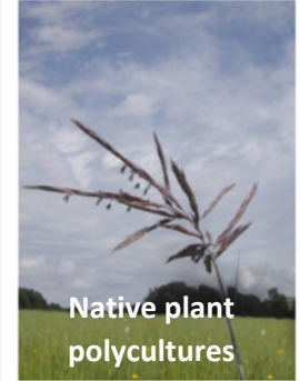
Native plant polycultures