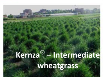
Kernza® – Intermediate wheatgrass